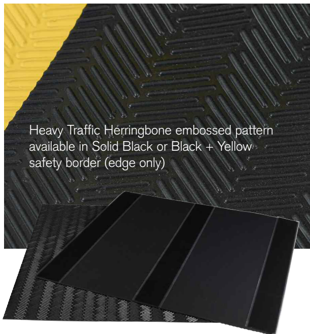
Heavy Traffic Herringbone embossed pattern available in Solid Black or Black + Yellow safety border (edge only)

Tuff Trac® EPDM walk pad also available with factory applied PSA backing for easy installation.